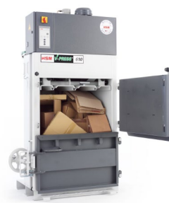
V Press 610