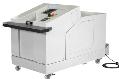
HDS 230 Hard Drive Shredder