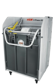
V Press 60

Due to their size, cost efficiency and capacity, HSM's vertical baling presses of the V-Press series are incredibly well-suited for industry, manufacturers and trading alike. With this compact baling press, you can reduce the volume of your on-site packaging material by up to 95%.