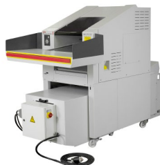
Powerline SP 5080