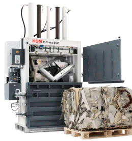
V Press 860 S