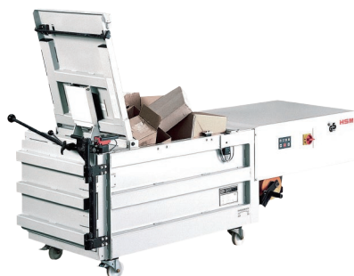
HL 8 TE

The HSM horizontal baling presses are suitable for industry, manufacturers and waste disposal companies. With the ability to compact paper, cardboard and foil, the baling presses of the HL series feature low overall height and a large loading aperture, facilitating handling of these materials by the user.