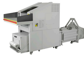
Powerline SP 5088