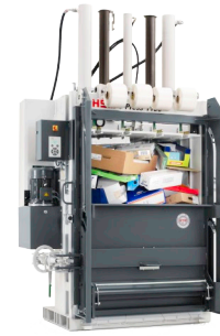
V Press 1160