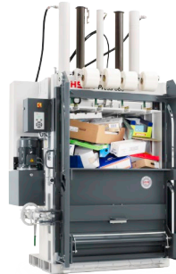
V Press 860