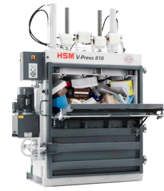
V Press 818