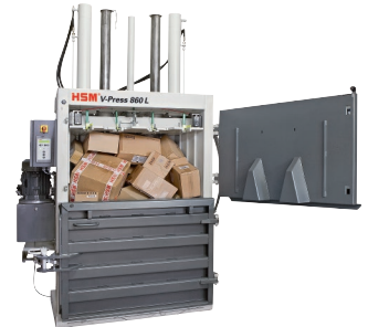
V Press 860 L