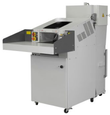
Powerline SP 4040