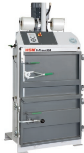
V Press 504