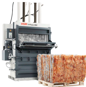
V Press 860 P