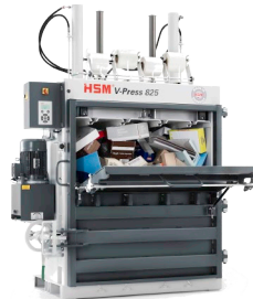
V Press 825