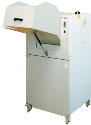
PET Crusher 1049 SA Bottle & Can Crusher