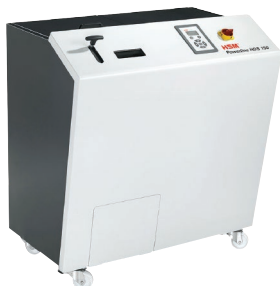
HDS 150 Hard Drive Shredder

The HSM Powerline hard drive shredders destroy digital and magnetic media (i.e. USB sticks, magnetic tapes, CDs, DVDs and Blu-ray discs, credit cards, loyalty cards and disks) into tiny particles making recovery practically impossible. Safe and efficient to sue, data protection compliant.