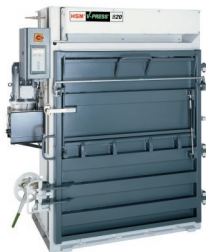
V Press 820