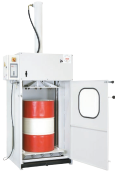
FP 3000 Barrel Press